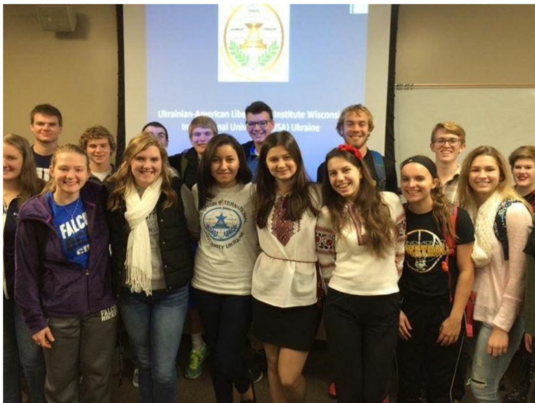
At Concordia University Wisconsin / Ann Arbor

The Dual Master's Degree Program with our cofounder Concordia University Wisconsin / Ann Arbor (USA) will allow you to achieve an MBA degree from both universities. CUW offers a variety of majors and minors, so ConcordiaUA students who choose this program can pursue an MBA in Management, International Business, Finance, Health Care Administration, Innovation & Entrepreneurship, Management Information Systems, Sport and Entertainment Business, etc.